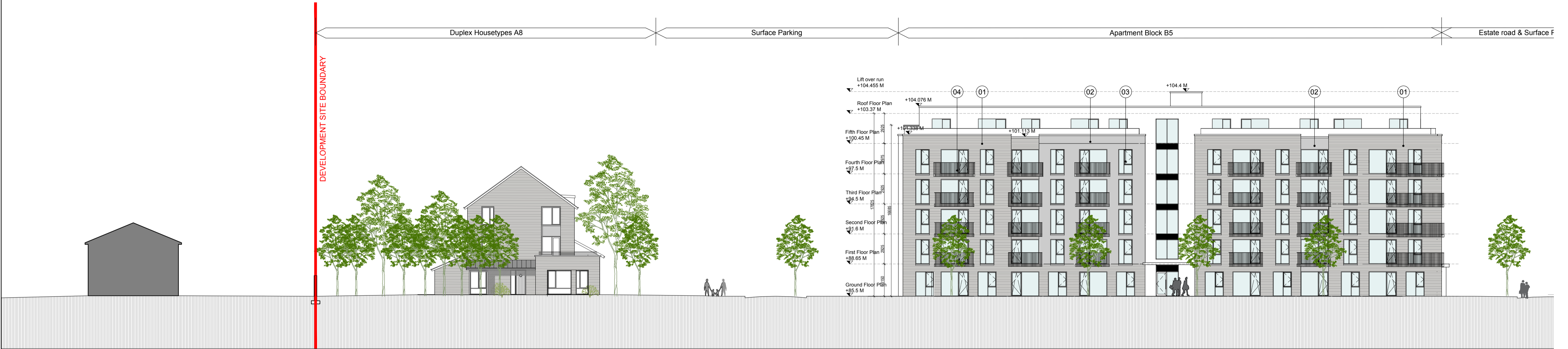
SITE SECTION D-D 1:200