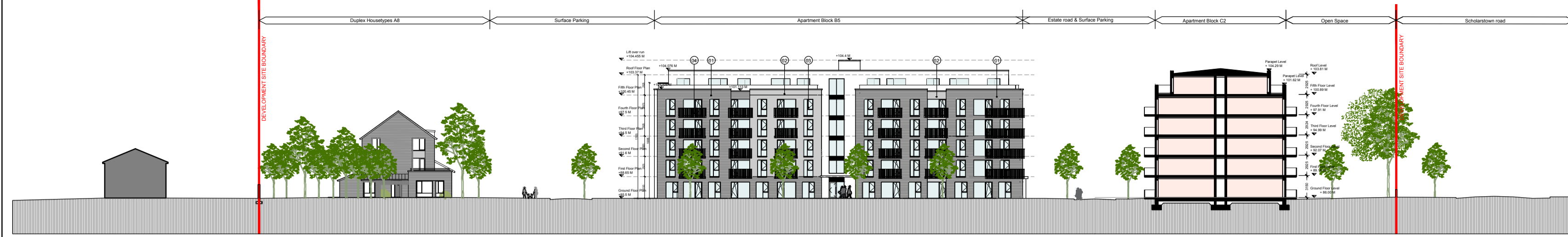
SITE SECTION D-D 1:500